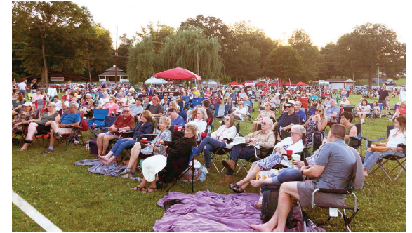
THE FESTIVAL'S ATTENDANCE CONTINUES TO GROW

Our Sponsors enjoy a wealth of brand exposure opportunities. Depending on the sponsorship package that is chosen, you can expect your brand's name and logo to be featured on the Iron Bridge Music Festival's website, social media posts, emails and large digital message boards before and during the event.