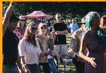
LIVE MUSIC + NICE WEATHER = FUN!