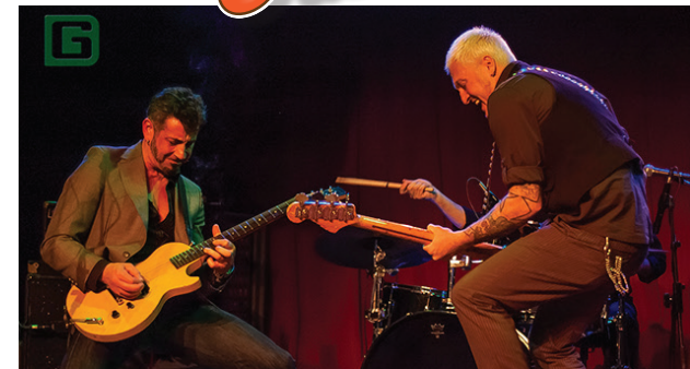
THE MARTINI BROTHERS

Friday, Saturday & Sunday June 14, 15 & 16, 2024 New Cumberland Borough Park and the West Shore Theatre New Cumberland, PA