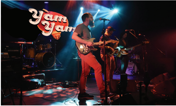
YAM YAM PRESENTS AN AMAZING CONFECTION OF JAZZ, GOSPEL, JAM AND FUNK

Nestled in a large sweep of the scenic Yellow Breeches Creek, Borough Park makes a perfect location for musicians, vendors and concert-goers.